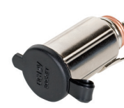
7160-0063 AUX 12v Power Outlet