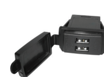
15371 Dual USB Power Ports