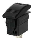
7160-0517 Rocker Switch (on/off)