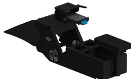
7170-0887-06 2021+ Dodge Charger Console Box Kit with Cup Holder, Rear Armrest, and Mongoose® XE 9" Motion Attachment