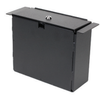
7160-0388 Tall Locking Pocket