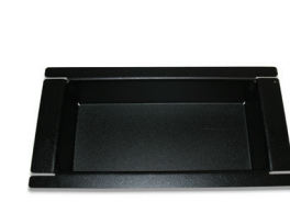
16298 4.5" x 2" Deep Pocket