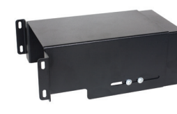
WIRING CHASE COVER 7110-1024 For Chevy Tahoe/ Silverado Consoles