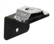
MCS-EPICMIC Microphone Clip

*See website for more console accessories