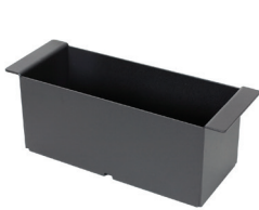
7160-0332 Short Pocket