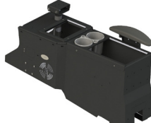
7170-0822-01 Full Depth Console with Cup Holder and Side Armrest