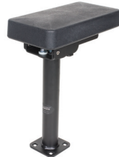
7160-0525 Breakaway Armrest