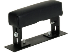
7160-0375 Extended Panel Armrest