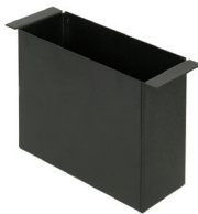
MCS-POCKET3 Tall Pocket