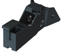
7170-0734-04 Low-Profile Console with Cup Holders, Rear Armrest, and Mongoose