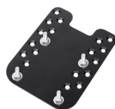
7160-0872 Offset Adapter Bracket