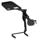
7160-1346-01 Ford Police Interceptor Utility (2020+) On-Dash Mount with 3" Extension Arm