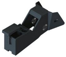
7170-0734-01 Low-Profile Console with Cup Holders and Rear Armrest