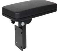
7160-0429 Exterior Armrest