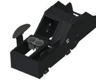
7170-0848-00 Wide Body Console with Armrest and Cup Holder