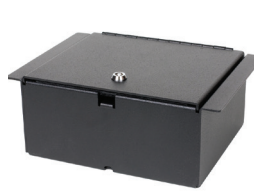
7160-0389 Short Locking Pocket