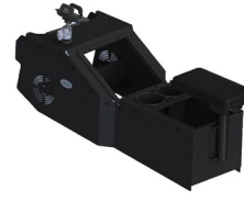
7170-0884-01 Console Box with Rear Armrest, Cup Holders and Phone Mount