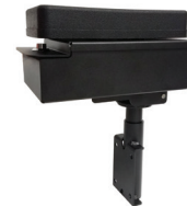
7170-0608-01 Breakaway Armrest Lockbox with Vertical Surface Mount