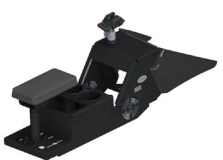
7170-0927-01 2021+ Dodge Charger Console (Short 8.5") Kit with Magnetic Phone Holder, Cup Holder, and Break-Away Rear Armrest