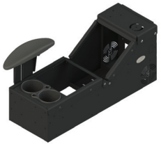
7170-0579-01 Universal Sloped Front Console with Cup Holders and Armrest

See website for recommended leg kit and top plate.