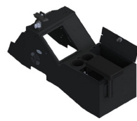
7170-0882-01 Console with Cup Holders, Rear Armrest and Phone Holder