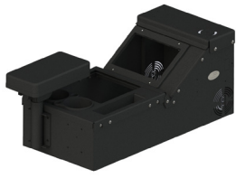
7170-0567-01 Wide Body Console with Cup Holders, Pocket and Armrest Kit