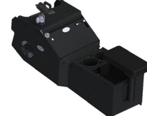
7170-0885-01 Console with Printer Mount, Cup Holders and Rear Armrest