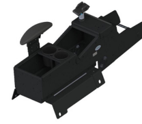
7170-0893-01 Console with Cup Holder, Armrest and Phone Holder