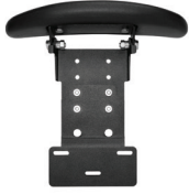
7110-1013 Side Armrest