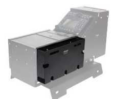
7160-0464 Side Storage Pocket