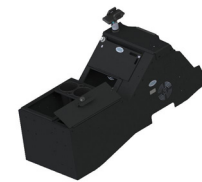
7170-0883-01 Console with Printer Mount, Cup Holder, Armrest and Phone Holder