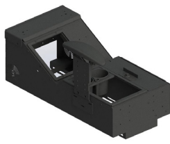
7170-1006-01 Universal Console with Locking Storage, Cup Holder and Armrest