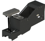
7170-0735-01 Short Console with Cup Holders and Rear Armrest