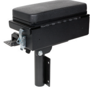
7160-0430 Brother® Printer Armrest