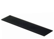
BLANK FILLER PANELS