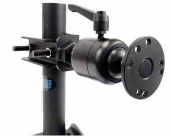
7160-1367-01 Zirkona 3/4" to 1 7/8" Pole Mount with VESA 75mm Mounting Plate