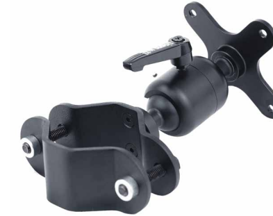
7160-1356-01 Zirkona 2" to 3" Pole Mount with VESA 75mm Mounting Plate