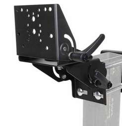
7160-0366 Dual Clam Shell with Small Backer Plate