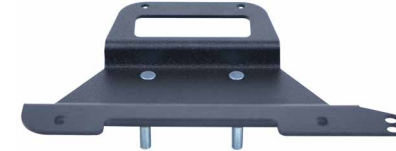
7160-0817 Zebra ZQ630/QLN420 Printer Bracket

Continue to expand from a desk to a mobile work environment by creating a secure and accessible way to mount rugged mobile printers.