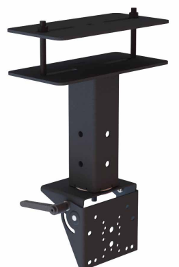
7160-0368 Overhead Guard Mount with Single Clam Shell