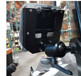
7160-1816 Honeywell RP4 Printer Mount