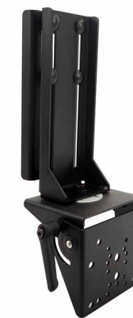
7160-1156-01 Tall Overhead Bar Mount