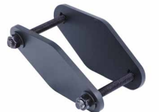
7160-1333 Power Supply Clamp