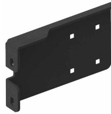
7160-1103 Linde E30 Latch Mounting Bracket