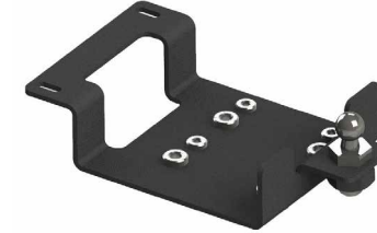
7160-1473 Zebra ZQ620 Printer Bracket