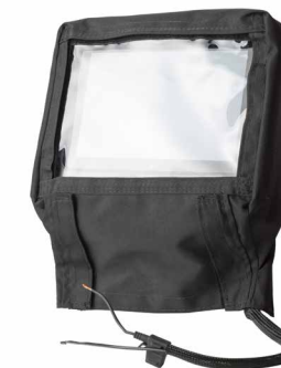
7160-0949 8" Protective Cover 7160-0950 10" Protective Cover 7160-0981 8" Thermal Protective Cover 7160-0982 10" Thermal Protective Cover

Encase your device with Gamber-Johnson's patented selection of thermal and non-thermal protective covers. Designed to keep your device safe from the harsh elements in unforgiving work environments that could prematurely destroy your assets.