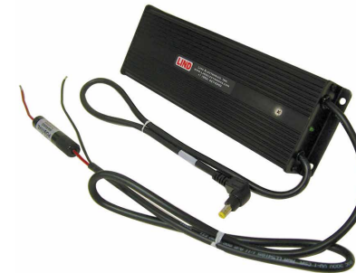
LIND ISOLATED POWER SUPPLY FOR PANASONIC

Protect and power your valuable devices by pairing them with a clean, stable power source to guarantee functionality and longevity. Combine with a Gamber-Johnson Wiring Kit and Power Supply Mount for a professional look and quick installation.