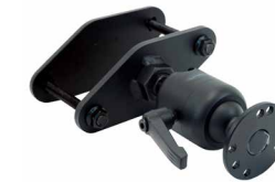
7160-1261 Zirkona 4" Diamond Plate with Large Joiner and AMPS/NEC Plate

When it comes to mounting lightweight devices turn to Gamber-Johnson's diamond plate mounts for a reliable solution. Multiple product offerings to interface your device with various hole patterns and ample adjustability to accommodate operator comfort and ease of use.