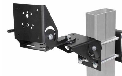
7160-0420 Dual Clam Shell with Arm and Small Backer Plate