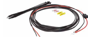
7300-0482 Wiring Kit