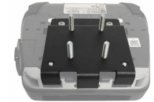
7160-1053 Zebra ZQ500 Printer Mount