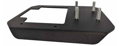
7160-1821 Honeywell RP2 Printer Mount