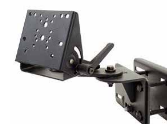
7160-1505 Fixed Base, Clamshell with Articulating Arm and Large Plate