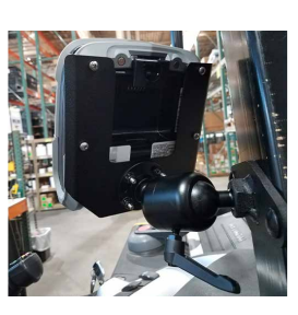
Honeywell RP4 Printer Mount