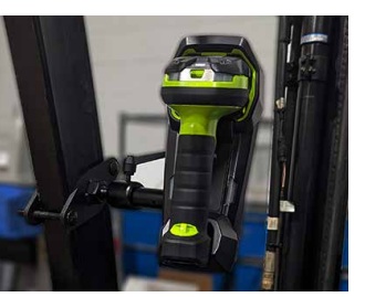
ZEBRA DS3678 SCANNER CRADLE MOUNTS