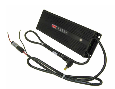
LIND ISOLATED POWER SUPPLY FOR DELL

Protect and power your valuable devices by pairing them with a clean, stable power source to guarantee functionality and longevity. Combine with a Gamber-Johnson Wiring Kit and Power Supply Mount for a professional look and guick installation.