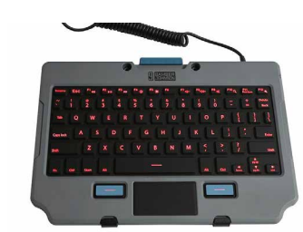
Rugged Lite Backlit Keyboard and Quick Release Keyboard Cradle