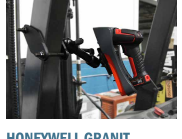
HONEYWELL GRANIT CRADLE MOUNTS