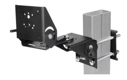
Dual Clam Shell with Arm and Small Backer Plate Dual Clam Shell with Arm and Large Backer Plate