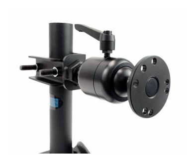
/160-136/-01 Zirkona 3/4" to 1 7/8" Pole Mount with VESA 75mm Mounting Plate

7160-1367 Zirkona 3/4" to 1-7/8" Pole Mount with AMPS/ NEC Mounting Plate