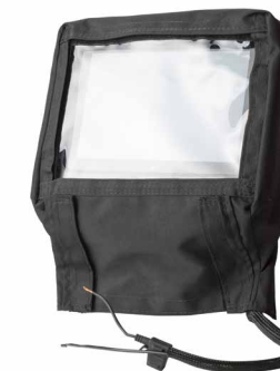
7160-0949 8" Protective Cover 7160-0950 10" Protective Cover 7160-0981 8" Thermal Protective Cover 7160-0982 10" Thermal Protective Cover

Encase your device with Gamber-Johnson's patented selection of thermal and non-thermal protective covers. Designed to keep your device safe from the harsh elements in unforgiving work environments that could prematurely destroy your assets.