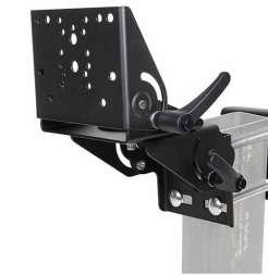
7160-0366 Dual Clam Shell with Small Backer Plate