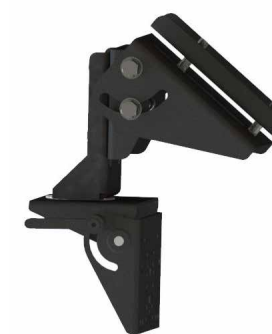
7160-1591 Tall Adjustable Overhead Guard Bar-short

Increase your operator's forward visibility by tucking your device up and out of the way. Directly mount from the overhead guard using various ergonomic options that best fit a wide variety of operator needs and preferences.