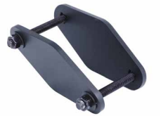
7160-1333 Power Supply Clamp