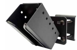
7160-1306 Scanner Pocket Mount with Small Back Plate