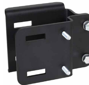
7160-0418 For Yale/Hyster, Crown, and others

Pair with with DUAL CLAM SHELL MOUNT (PG. 7) to complete your solution