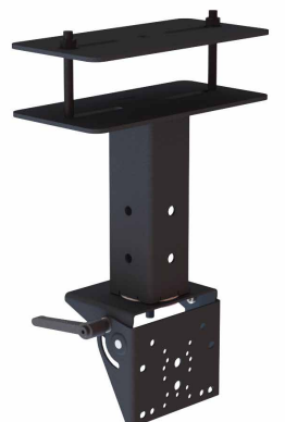
7160-0368 Overhead Guard Mount with Single Clam Shell