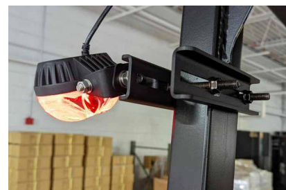
7160-1719 Forklift Light Mount