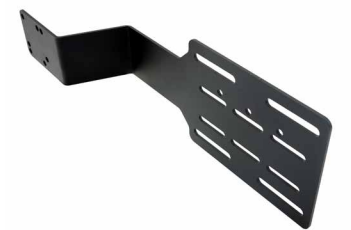
7160-0859 Number Pad Bracket