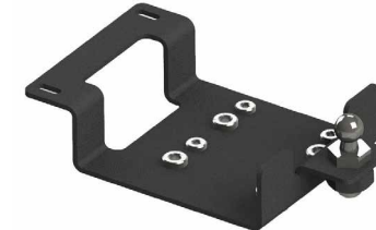
7160-1473 Zebra ZQ620 Printer Bracket