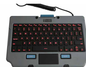
7170-0817-01 Rugged Lite Backlit Keyboard and Quick Release Keyboard Cradle