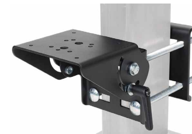
7160-0357 Clam Shell with Small Backer Plate

Our Clam Shell line is Gamber-Johnson's staple product when it comes to extending the usability of technology into the mobile world of material handling. Easily attach any device, dock, cradle, or interface plate with the multiple hole patterns featured on the product. Our Clam Shells work to tailor to individual operator comfort and safety by providing a wide range of adjustments for optimal viewing of a device, improved visibility, and proximity to the operator.