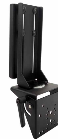
7160-1156-01 Tall Overhead Bar Mount