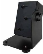
7160-1259 Flat Surface Magnet Mount with Scanner Holder