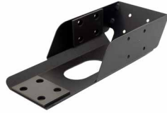
7160-1380 Pistol Grip Scanner Bracket