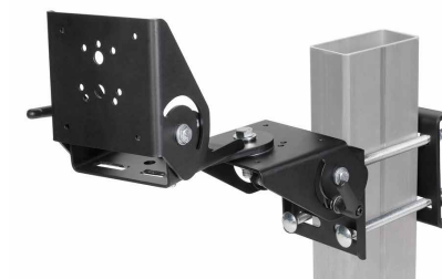
7160-0420 Dual Clam Shell with Arm and Small Backer Plate