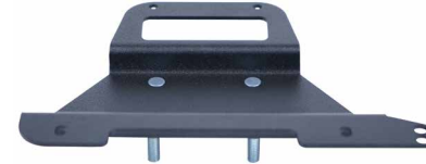
7160-0817 Zebra ZQ630/QLN420 Printer Bracket

Continue to expand from a desk to a mobile work environment by creating a secure and accessible way to mount rugged mobile printers.