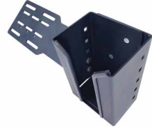
7160-1389 Scanner Pocket Tablet Mount