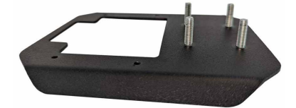
7160-1821 Honeywell RP2 Printer Mount