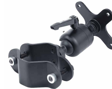
7160-1356-01 Zirkona 2" to 3" Pole Mount with VESA 75mm Mounting Plate