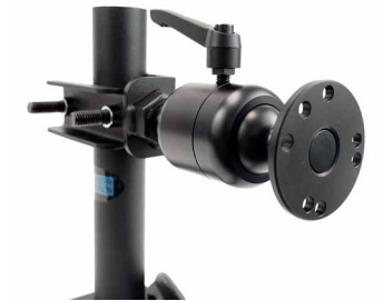
7160-1367-01 Zirkona 3/4" to 1 7/8" Pole Mount with VESA 75mm Mounting Plate