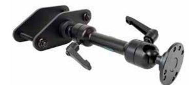
7160-1466 Zirkona, 4" Diamond Plate with 6" Medium Dog-Bone and AMPs Plate