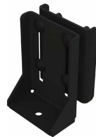
7160-0610 Single Light Bracket

Mount safety lights to present a visual alert to help increase warehouse safety, minimize the risk of accidents, and improve visible awareness of approaching lift vehicles.