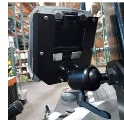
7160-1816 Honeywell RP4 Printer Mount