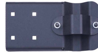
7160-0561 2", 2.5", 3" Diameter Tube Clamp

Expand your mounting location options by connecting your solution to multiple sizes of cylindrical poles, handles, or tubular style overhead guard legs. Adapt a Clam Shell product to finalize the total solution.