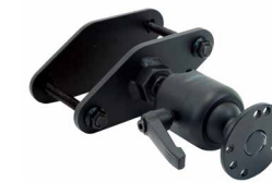
7160-1261 Zirkona 4" Diamond Plate with Large Joiner and AMPS/NEC Plate

When it comes to mounting lightweight devices turn to Gamber-Johnson's diamond plate mounts for a reliable solution. Multiple product offerings to interface your device with various hole patterns and ample adjustability to accommodate operator comfort and ease of use.