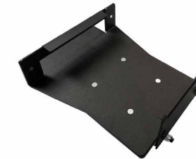
7160-1693 ZEBRA ZD620D, ZD620T, ZD621D, and ZD621T, 75MM HP Printer Mount