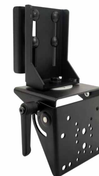
7160-1156 Short Overhead Bar Mount