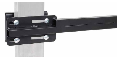
7160-0363 Horizontal Extension Bar

Increase your usable mounting space with our horizontal extension giving you more room to mount a total solution. Compatible with all Gamber-Johnson's roll formed and tube clamp brackets to ensure secure fitment to any overhead guard leg profile.