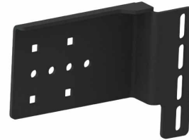
7160-1233 Toyota Cab Mount