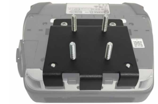
7160-1053 Zebra ZQ500 Printer Mount