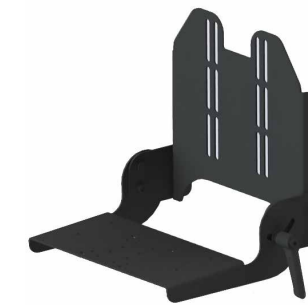
7160-0799 Tablet Keyboard Mount 7160-0799-01 Tablet Keyboard Mount - Tall Backplate

Configure your keyboard for ultimate ease of use and the fastest possible access with our large selection of Keyboard Mounts. With an ergonomic angle that meets user needs, working on the keyboard in the field can be more streamlined and reliable than ever before.