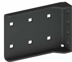
7160-1096 Clamp Bracket Adapter