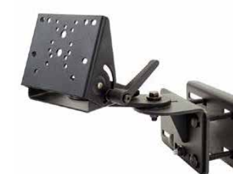
7160-1505 Fixed Base, Clamshell with Articulating Arm and Large Plate