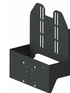
7160-1257 Vertical Tablet Keyboard Mount 7160-1257-01 Vertical Tablet Keyboard Mount - Tall Backplate