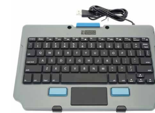
7160-1449-00 Rugged Lite Keyboard