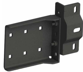
7160-1151 Toyota Cab Latch Mount for Electronic Hydraulics

Secure your valuable tablets and devices right in the cab of your material handling vehicle using one of our reliable OEM specific mounts. Perfectly suited to tailor your workspace to the most efficient, ergonomic, and secure configuration, all while protecting your valuable assets and lift vehicle operators.