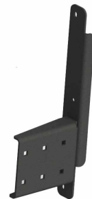
7160-1109 Yale/Hyster Electric Bracket