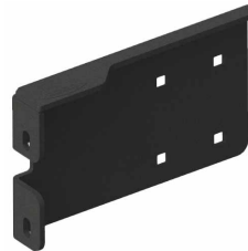
7160-1103 Linde E30 Latch Mounting Bracket