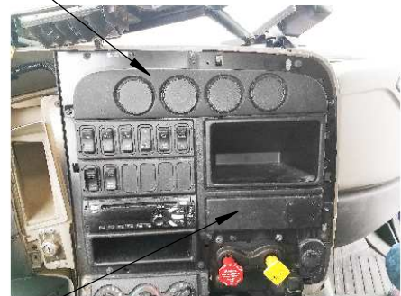
lower plastic molding