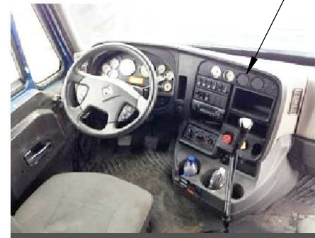
top gauge cluster