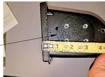
AMP's back plate