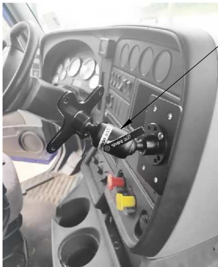
Zirkona Semi Truck Mount

The International ProStar Pocket Mount is designed to work in conjunction with a Zirkona Semi Truck Mount or a Logistics Pivot Arm Mount. Once the adjoining mount has been attached a docking station or cradle can be added to complete the setup.