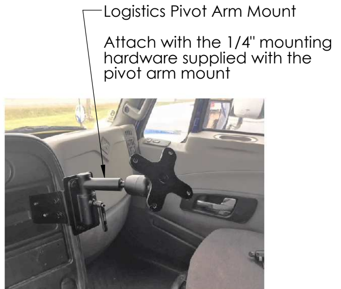
Logistics Pivot Arm Mount

Attach with the #10-32 mounting hardware supplied with the semi truck mount