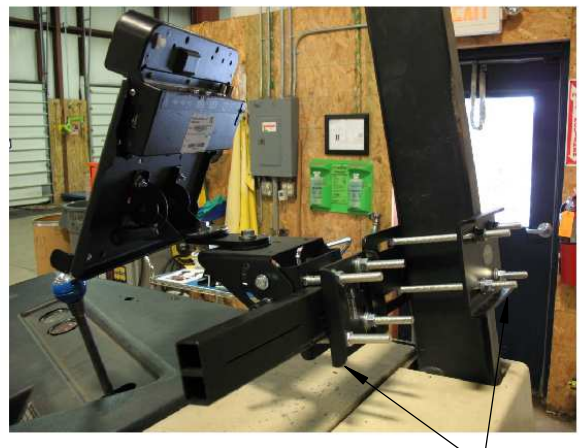
NOTE: Orientation of bends on backer plate

Views of pillar mount 7160-0364 mounted on an Extension tube to position the computer equipment in front of the fork truck