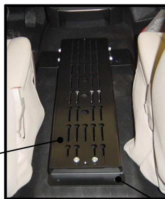
FIG. 3 Ford Expedition Leg Kit and Top Plate Installed