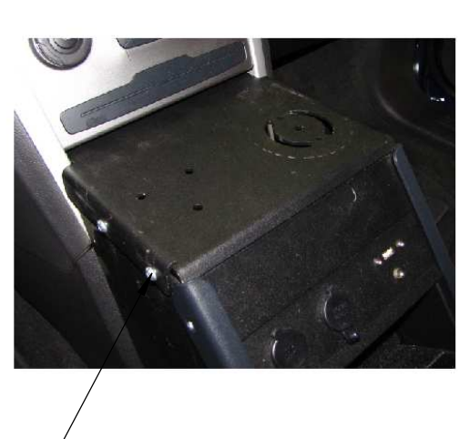
1/4-20 x 1/2" long socket button head screws

Step 6. Attach the main bracket to the vehicle specific console box with the (4)\ 1/4-20\ x\ 7/8 " long socket button head machine screws provided in the hardware bag.