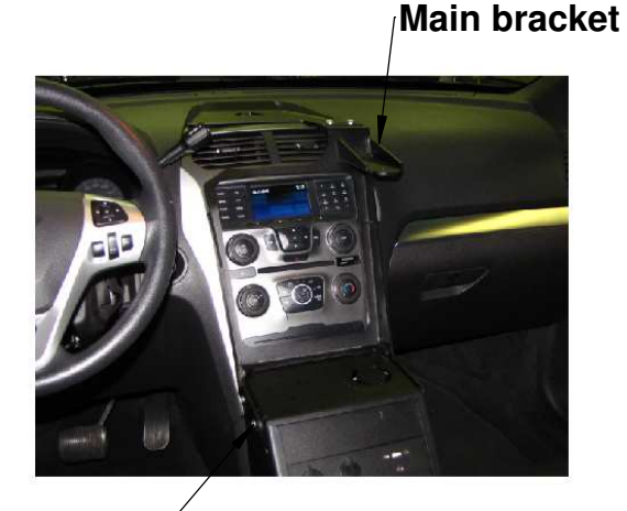
1/4-20 x 7/8" long socket button head screws