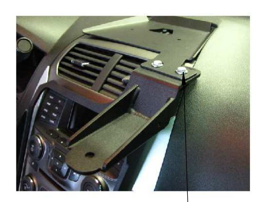
3/8-16 x 3/4" long hex bolts and flat washers