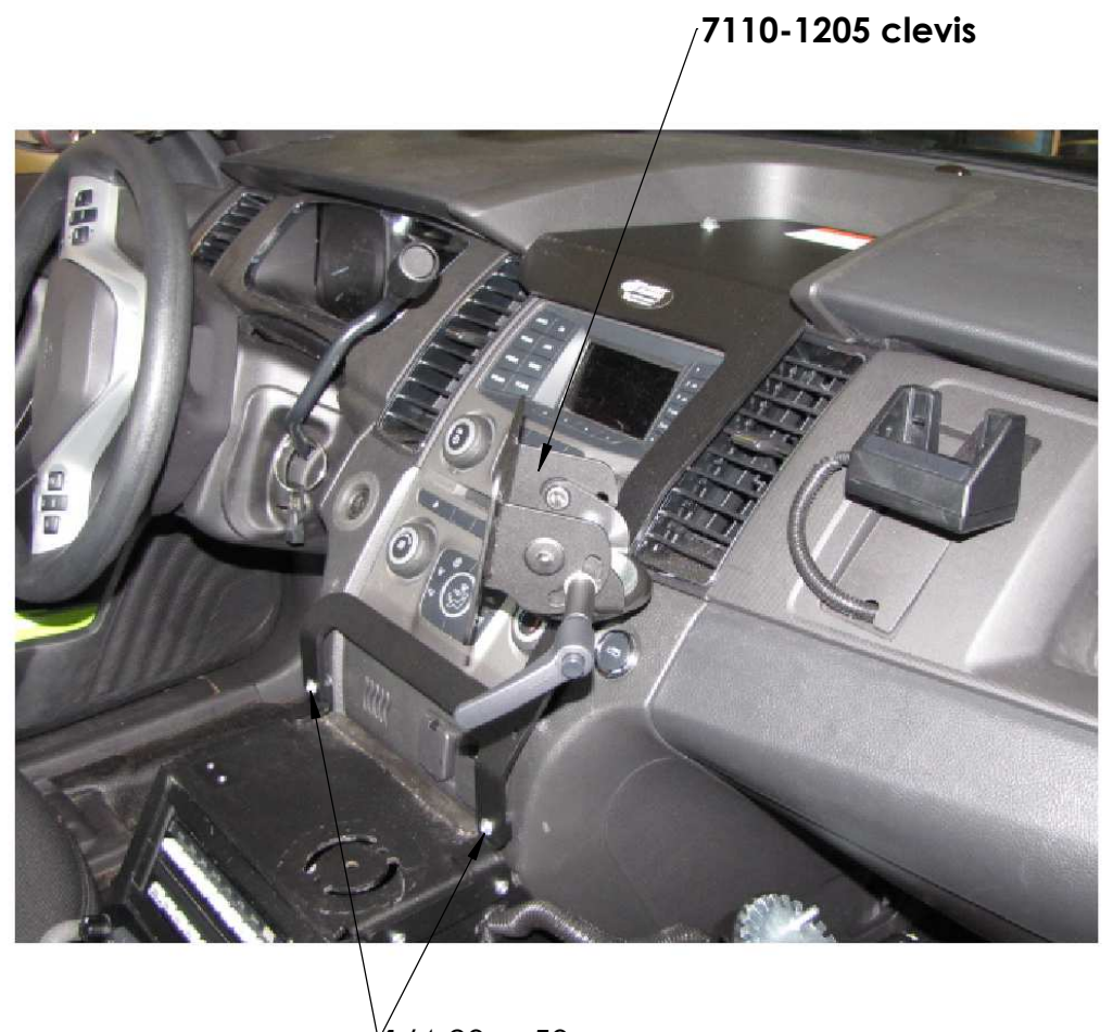
\sqrt{1/4-20} \times .50 \text{ screws}

Step 7. Attach the custom clevis (7110-1205) with the 3/8-16 \times 1.25 " long hex bolt, washers, and nylock nut provided in the hardware bag. See next page for exploded view of attachment.