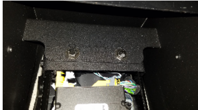
Fig. 3 3/4