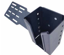
7160-1389 Scanner Pocket Tablet Mount