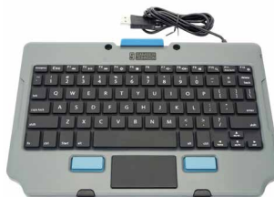
7160-1449-00 Rugged Lite Keyboard