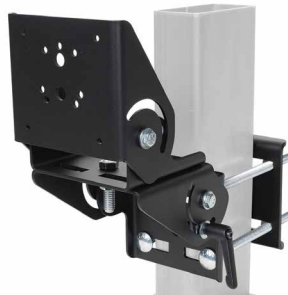
7160-0366 Dual Clam Shell with Small Backer Plate 7160-0367 Dual Clam Shell with Large Backer Plate