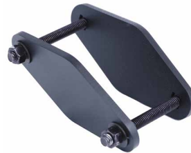
7160-1333 Power Supply Clamp