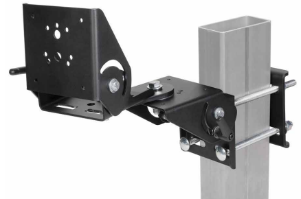
7160-0420 Dual Clam Shell with Arm and Small Backer Plate 7160-0421 Dual Clam Shell with Arm and Large Backer Plate