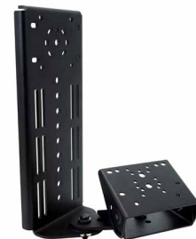
7160-0984 Low Profile Tablet Keyboard Bracket