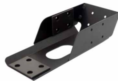
7160-1380 Pistol Grip Scanner Bracket