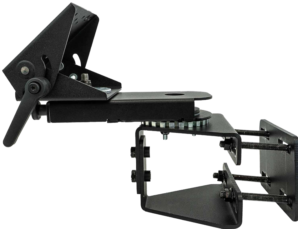
7160-1841 Guard Leg Mount with Locking Swing Arm Mount