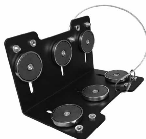
7160-0850 TYRI Redline Light Mount