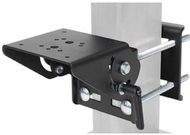
7160-0357 Clam Shell with Small Backer Plate 7160-0370 Clam Shell with Large Backer Plate

Our Clam Shell line is Gamber-Johnson's staple product when it comes to extending the usability of technology into the mobile world of material handling. Easily attach any device, dock, cradle, or interface plate with the multiple hole patterns featured on the product. Our Clam Shells work to tailor to individual operator comfort and safety by providing a wide range of adjustments for optimal viewing of a device, improved visibility, and proximity to the operator.