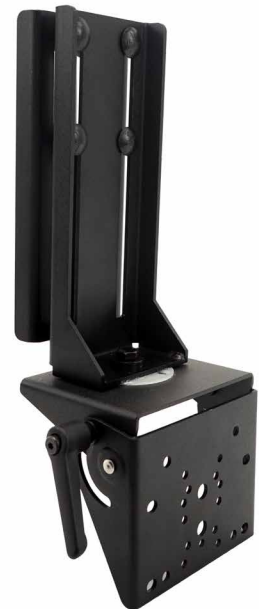
7160-1156-01 Tall Overhead Bar Mount