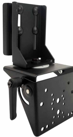
7160-1156 Short Overhead Bar Mount