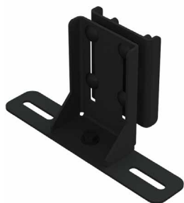
7160-0611 Single Light Bracket