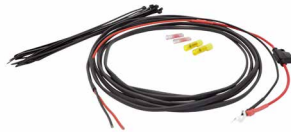
7300-0482 Wiring Kit