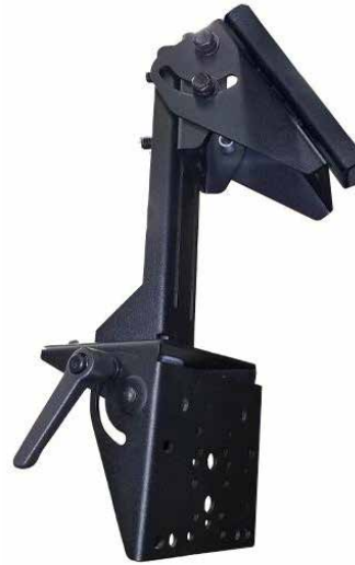
7160-1591-01 Tall Adjustable Overhead Guard Bar