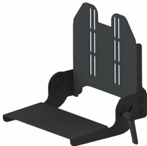
7160-0799 Tablet Keyboard Mount

Configure your keyboard for ultimate ease of use and the fastest possible access with our large selection of Keyboard Mounts. With an ergonomic angle that meets user needs, working on the keyboard in the field can be more streamlined and reliable than ever before.