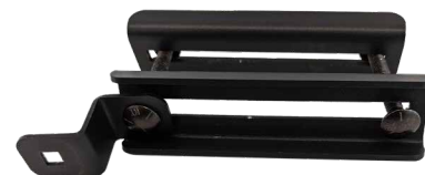
7160-1719 Forklift Light Mount