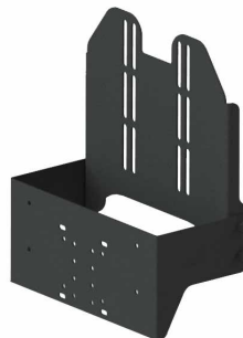
7160-1257 Vertical Tablet Keyboard Mount