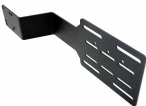
7160-0859 Number Pad Bracket