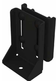
7160-0610 Single Light Bracket

Mount safety lights to present a visual alert to help increase warehouse safety, minimize the risk of accidents, and improve visible awareness of approaching lift vehicles.