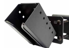
7160-1306 Scanner Pocket Mount with Small Back Plate