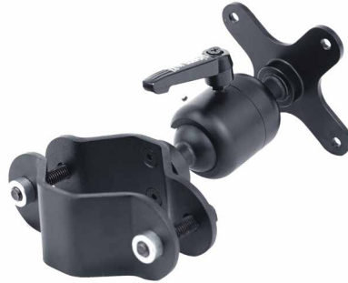
7160-1356-01 Zirkona 2" to 3" Pole Mount with VESA 75mm Mounting Plate