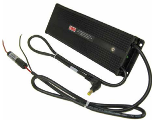
LIND Isolated Power Supply *See website for full assortment

Protect and power your valuable devices by pairing them with a clean, stable power source to guarantee functionality and longevity. Combine with a Gamber-Johnson Wiring Kit and Power Supply Mount for a professional look and quick installation.