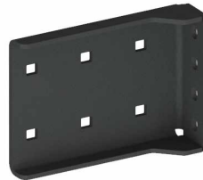
7160-1096 Clamp Bracket Adapter