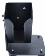
7160-1259 Flat Surface Magnet Mount with Scanner Holder