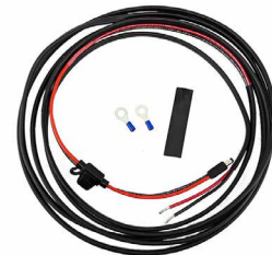
7160-1804 Wire Harness - 2.5mm DC Power Plug with 10 amp In-line Fuse