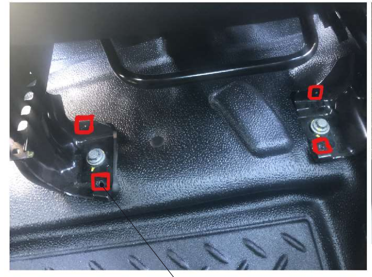
FIG.2 4X T20 Screw Front passenger seat