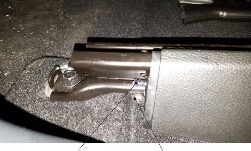
FIG.3 Front passenger, Side View seat, rear bolts