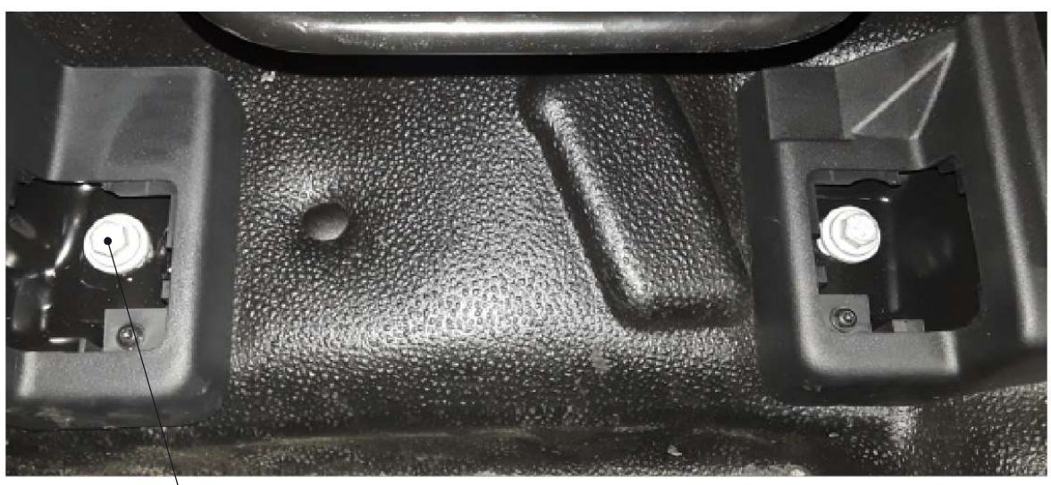
Front Passenger Seat Bolt