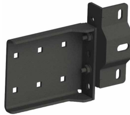
7160-1151 Toyota Cab Latch Mount for Electronic Hydraulics

Secure your valuable tablets and devices right in the cab of your material handling vehicle using one of our reliable OEM specific mounts. Perfectly suited to tailor your workspace to the most efficient, ergonomic, and secure configuration, all while protecting your valuable assets and lift vehicle operators.