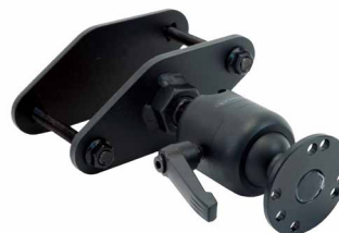
7160-1261 Zirkona 4" Diamond Plate with Large Joiner and AMPS/NEC Plate

When it comes to mounting lightweight devices turn to Gamber-Johnson's diamond plate mounts for a reliable solution. Multiple product offerings to interface your device with various hole patterns and ample adjustability to accommodate operator comfort and ease of use.