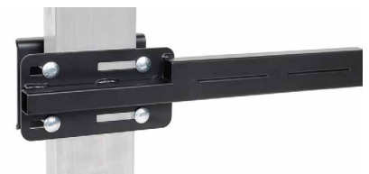
7160-0363 Horizontal Extension Bar

Increase your usable mounting space with our horizontal extension giving you more room to mount a total solution. Compatible with all Gamber-Johnson's roll formed and tube clamp brackets to ensure secure fitment to any overhead guard leg profile.