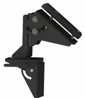
7160-1591 Tall Adjustable Overhead Guard Bar-short