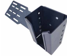
7160-1389 Scanner Pocket Tablet Mount