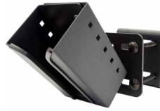
7160-1306 Scanner Pocket Mount with Small Back Plate