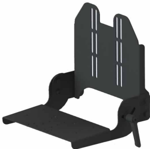
7160-0799 Tablet Keyboard Mount

Configure your keyboard for ultimate ease of use and the fastest possible access with our large selection of Keyboard Mounts. With an ergonomic angle that meets user needs, working on the keyboard in the field can be more streamlined and reliable than ever before.