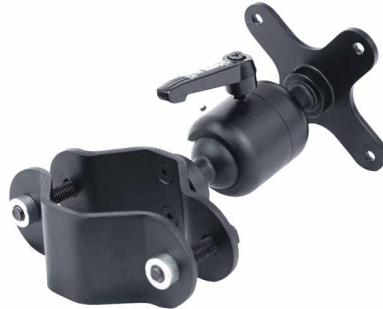
7160-1356-01 Zirkona 2" to 3" Pole Mount with VESA 75mm Mounting Plate