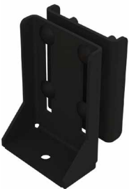
7160-0610 Single Light Bracket

Mount safety lights to present a visual alert to help increase warehouse safety, minimize the risk of accidents, and improve visible awareness of approaching lift vehicles.