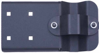
7160-0561 2", 2.5", 3" Diameter Tube Clamp

Expand your mounting location options by connecting your solution to multiple sizes of cylindrical poles, handles, or tubular style overhead guard legs. Adapt a Clam Shell product to finalize the total solution.