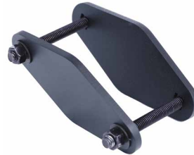
7160-1333 Power Supply Clamp