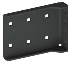
7160-1096 Clamp Bracket Adapter