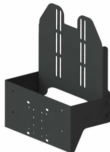
7160-1257 Vertical Tablet Keyboard Mount