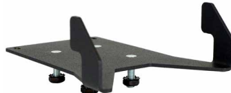
7160-1473 Zebra ZQ620 Printer Bracket