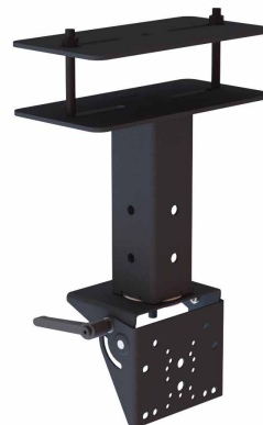
7160-0368 Overhead Guard Mount with Single Clam Shell