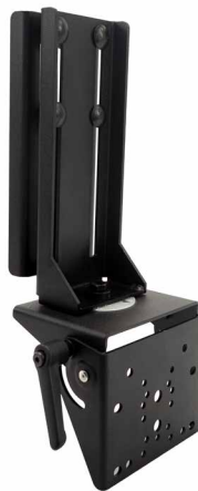
7160-1156-01 Tall Overhead Bar Mount