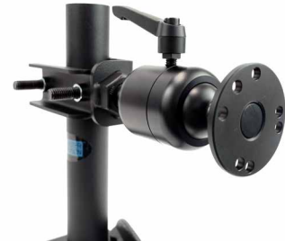
7160-1367-01 Zirkona 3/4" to 1 7/8" Pole Mount with VESA 75mm Mounting Plate