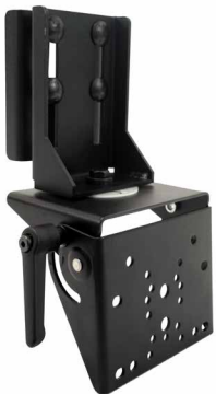
7160-1156 Short Overhead Bar Mount