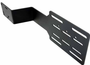
7160-0859 Number Pad Bracket