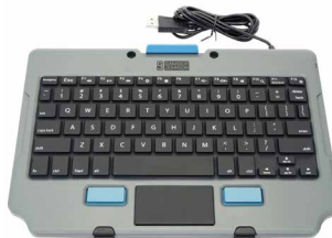
7160-1449-00 Rugged Lite Keyboard