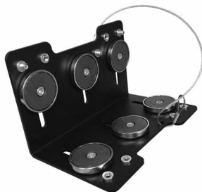
7160-0850 TYRI Redline Light Mount