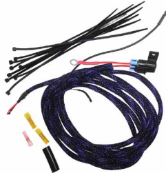
7400-0009 Wiring Kit