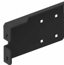
7160-1103 Linde E30 Latch Mounting Bracket