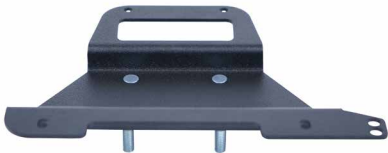
7160-0817 Zebra ZQ630/QLN420 Printer Bracket

Continue to expand from a desk to a mobile work environment by creating a secure and accessible way to mount rugged mobile printers.