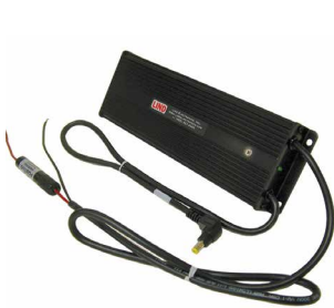
LIND Isolated Power Supply *See website for full assortment

Protect and power your valuable devices by pairing them with a clean, stable power source to guarantee functionality and longevity. Combine with a Gamber-Johnson Wiring Kit and Power Supply Mount for a professional look and quick installation.