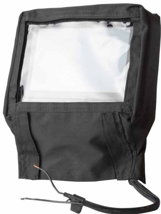
7160-0949 - 8" Protective Cover 7160-0950 - 10" Protective Cover 7160-0981 - 8" Thermal Protective Cover 7160-0982 - 10" Thermal Protective Cover

Encase your device with Gamber-Johnson's patented selection of thermal and non-thermal protective covers. Designed to keep your device safe from the harsh elements in unforgiving work environments that could prematurely destroy your assets.