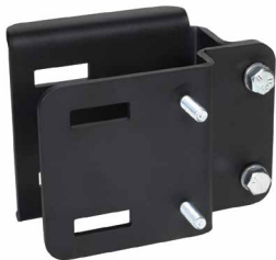
7160-0418 For Yale/Hyster, Crown, and others

We have the ideal products for every mounting situation; including lift vehicles that have roll formed overhead guard legs. These brackets conform perfectly to various roll formed profiles ultimately creating a solid foundation to adapt our Clam Shell product line.