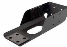
7160-1380 Pistol Grip Scanner Bracket