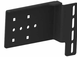
7160-1233 Toyota Cab Mount