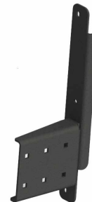
7160-1109 Yale/Hyster Electric Bracket