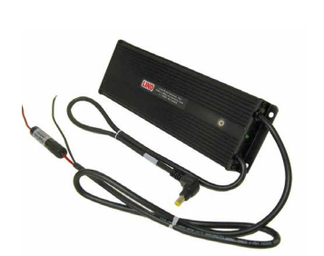
LIND Isolated Power Supply *See website for full assortment

Protect and power your valuable devices by pairing them with a clean, stable power source to guarantee functionality and longevity. Combine with a Gamber-Johnson Wiring Kit and Power Supply Mount for a professional look and quick installation.