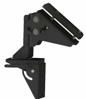
7160-1591 Tall Adjustable Overhead Guard Bar-short