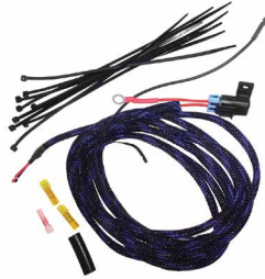
7400-0009 Wiring Kit