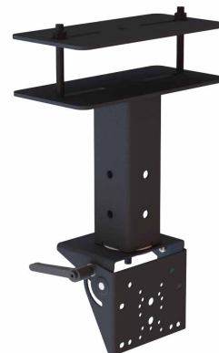
7160-0368 Overhead Guard Mount with Single Clam Shell