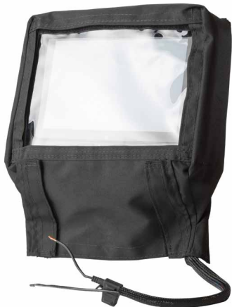
7160-0949 - 8" Protective Cover 7160-0950 - 10" Protective Cover 7160-0981 - 8" Thermal Protective Cover 7160-0982 - 10" Thermal Protective Cover

Encase your device with Gamber-Johnson's patented selection of thermal and non-thermal protective covers. Designed to keep your device safe from the harsh elements in unforgiving work environments that could prematurely destroy your assets.