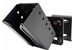
7160-1306 Scanner Pocket Mount with Small Back Plate