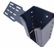
7160-1389 Scanner Pocket Tablet Mount