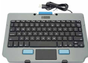
7160-1449-00 Rugged Lite Keyboard