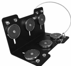
7160-0850 TYRI Redline Light Mount