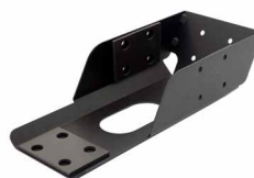
7160-1380 Pistol Grip Scanner Bracket