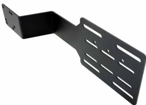
7160-0859 Number Pad Bracket