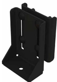
7160-0610 Single Light Bracket

Mount safety lights to present a visual alert to help increase warehouse safety, minimize the risk of accidents, and improve visible awareness of approaching lift vehicles.