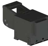
7170-0581-03 Large workstation with mounting legs and radio platform