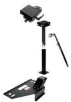
Ram ProMaster City 7170-0500 Pedestal system kit