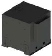
7170-0581-00 Large workstation with mounting legs