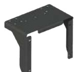
7160-0963 Computer platform for large workstation