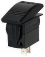
Rocker switch 7160-0517 Rocker switch (on/off)

Workstation kits are sold as-is, but you can order additional accessories such as pockets and filler panels. If you have a workstation box only (not a kit), you can build a one-of-a-kind solution for your vehicle by selecting the exact accessories you want.