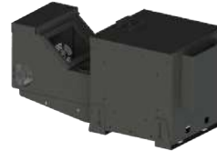
7170-0581-04 Large workstation with console box, console ledge, and mounting legs