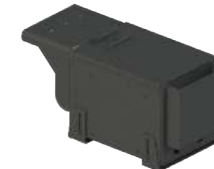
7170-0563-02 Small workstation with mounting legs and computer platform