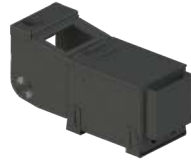
7170-0563-03 Small workstation with mounting legs and radio platform