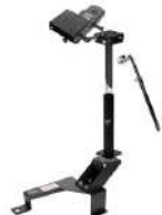
Ford F250-550 7170-0236 Pedestal system kit