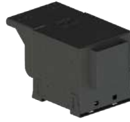
7170-0581-02 Large workstation with mounting legs and computer platform