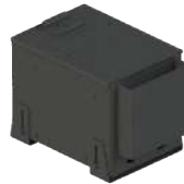
7170-0563-00 Small workstation with mounting legs