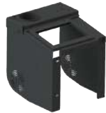
7160-0966 Radio platform for small workstation