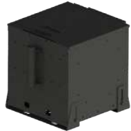
7170-0581-01 Large workstation with mounting legs and vertical surface mount