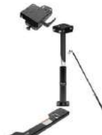
Ford Transit 7170-0226 Pedestal system kit