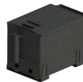
7170-0563-01 Small workstation with mounting legs and vertical surface mount