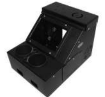
7160-0911 Workstation console box