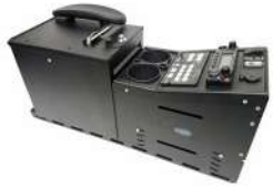
7170-0125 Worktruck console with file box, cup holder, armrest, and top plate