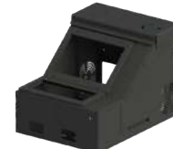
7160-0970 Console box with 3" and 5" mount openings