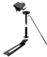
Ram ProMaster 7170-0239 Pedestal system kit