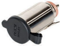
Adapter kit 7160-0063 Cigarette lighter adapter kit