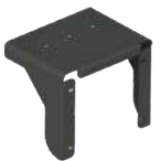
7160-0964 Computer platform for small workstation