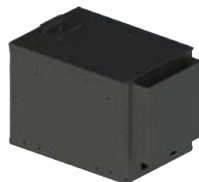
7160-0947 Small workstation (no legs)

Workstation kits come with accessories such as cup holders, arm rests, motion attachments, and more. To see all the kits, go to GamberJohnson.com .