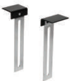
Two-piece faceplates See website for list