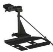
Semi Tractor 7170-0580 Pedestal system kit