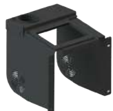
7160-0945 Radio platform for large workstation