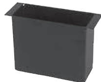
MCS-POCKET3 Tall pocket