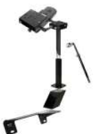
Dodge Ram 1500-5500 7170-0136 Pedestal system kit