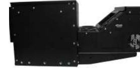
7170-0566 Large workstation with console box and shelf

Workstation boxes are designed for fleets that need to mount radios and other equipment within easy reach of the driver. Pedestals are for fleets that only need to mount a computer.