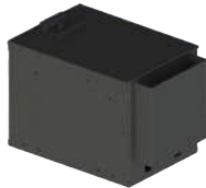
7160-0947 Small workstation (no legs)