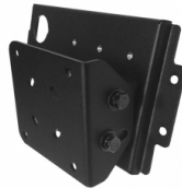
International LT Dash Mount