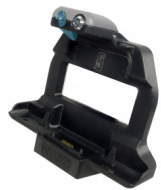
Getac ZX70 Powered Charging Cradle

Our Zirkona products feature an innovative, encapsulated joiner that provides all axis orientation. This allows the driver to adjust the device as needed. Zirkona can be configured to meet any fleets mounting need.