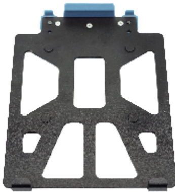
Fixed Keyboard Mount 7160-1474 (shown below)