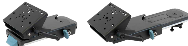
SHOWN: MONGOOSE® XLE 9"

XE stands for "eXtreme Edition". The pivot point is over center of the carriage. This version only allows the device to slide along the length of the arm.