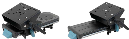
SHOWN: MONGOOSE® XE 9"

The Mongoose® XE and XLE product lines have one major difference between each other: