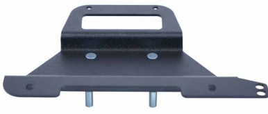
7160-0817 Zebra ZQ630/QLN420 Printer Bracket

Continue to expand from a desk to a mobile work environment by creating a secure and accessible way to mount rugged mobile printers.