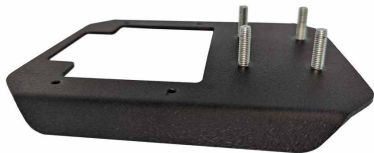
7160-1821 Honeywell RP2 Printer Mount