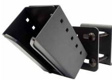
7160-1306 Scanner Pocket Mount with Small Back Plate

Safeguard handheld scanners from accidental drops and catastrophic damage by housing your device with the right mount to fit your operation's needs.