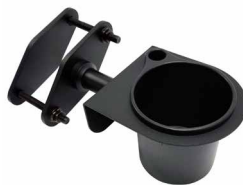
7160-1669 Fixed Forklift Cup Holder Mount