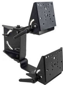
7160-2020 Guard Leg Mount with Dual Arms