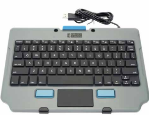
7160-1449-00 Rugged Lite Keyboard