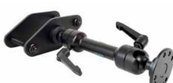
Zirkona 7160-1466 Zirkona, 4" Diamond Plate with 6" Medium Dog-Bone and AMPs Plate 7160-1466-01 Zirkona, 4" Diamond Plate with 6" Medium Dog-Bone and VESA 75 mm Plate