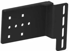
7160-1233 Toyota Cab Mount