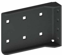
7160-1096 Clamp Bracket Adapter