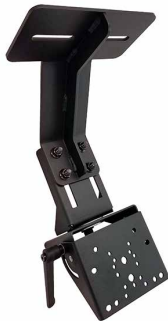
7160-1425 Overhead Guard Cab Mount