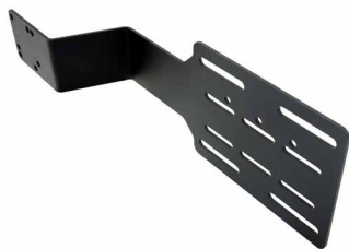
7160-0859 Number Pad Bracket