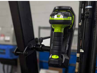
7170-0764 Zirkona, Pistol Grip Scanner Mount