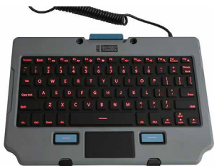
7170-0817-01 Rugged Lite Backlit Keyboard and Quick Release Keyboard Cradle