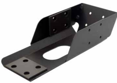
7160-1380 Pistol Grip Scanner Bracket