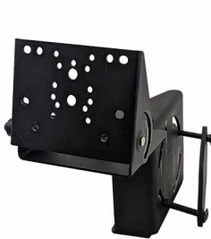
7160-1995 Guard Leg Mount