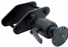
Zirkona 7160-1261 Zirkona 4" Diamond Plate with Large Joiner and AMPS/NEC Plate 7160-1261-01 Zirkona 4" Diamond Plate with Large Joiner and VESA 75mm Plate

When it comes to mounting lightweight devices turn to Gamber-Johnson's diamond plate mounts for a reliable solution. Multiple product offerings to interface your device with various hole patterns and ample adjustability to accommodate operator comfort and ease of use.