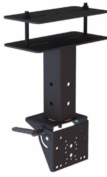
7160-0368 Overhead Guard Mount with Single Clam Shell