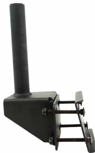
7160-1810 Shrink Wrap Mount - Small Back Plate