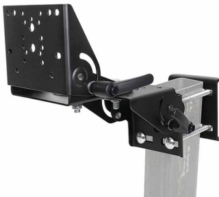
7160-0420 Dual Clam Shell with Arm and Small Backer Plate 7160-0421 Dual Clam Shell with Arm and Large Backer Plate