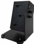
7160-1259 Flat Surface Magnet Mount with Scanner Holder