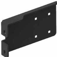
7160-1103 Linde E30 Latch Mounting Bracket