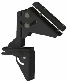
7160-1591 Tall Adjustable Overhead Guard Bar-short