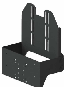
7160-1257 Vertical Tablet Keyboard Mount 7160-1257-01 Vertical Tablet Keyboard Mount - Tall Backplate