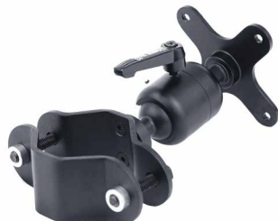
Zirkona 7160-1356-01 Zirkona 2" to 3" Pole Mount with VESA 75mm Mounting Plate 7160-1356 Zirkona 2" to 3" Pole Mount with AMPS/NEC Mounting Plate