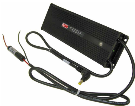
LIND ISOLATED POWER SUPPLY FOR PANASONIC* *See website for full assortment

Protect and power your valuable devices by pairing them with a clean, stable power source to guarantee functionality and longevity. Combine with a Gamber-Johnson Wiring Kit and Power Supply Mount for a professional look and quick installation.