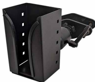
7170-0788 Zirkona 4" Diamond Mount w/Scanner Pocket