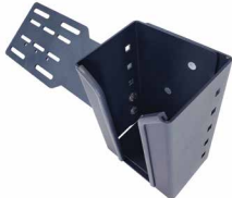
7160-1389 Scanner Pocket Tablet Mount