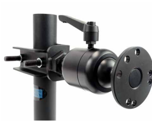
Zirkona 7160-1367-01 Zirkona 3/4" to 1 7/8" Pole Mount with VESA 75mm Mounting Plate 7160-1367 Zirkona 3/4" to 1-7/8" Pole Mount with AMPS/NEC Mounting Plate