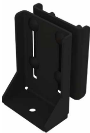
7160-0610 Single Light Bracket