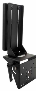
7160-1156-01 Tall Overhead Bar Mount