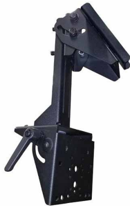
ADJUSTABLE OVERHEAD GUARD BAR-TALL 7160-1591-01

Increase your operator's forward visibility by tucking your device up and out of the way. Directly mount from the overhead guard using various ergonomic options that best fit a wide variety of operator needs and preferences.