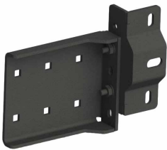
7160-1151 Toyota Cab Latch Mount for Electronic Hydraulics

Secure your valuable tablets and devices right in the cab of your material handling vehicle using one of our reliable OEM specific mounts. Perfectly suited to tailor your workspace to the most efficient, ergonomic, and secure configuration, all while protecting your valuable assets and lift vehicle operators.