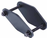
7160-1333 Power Supply Clamp