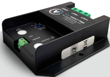
VOLTVAULT PRO SHUT DOWN TIMER 7300-0410