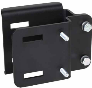
7160-0418 For Yale/Hyster, Crown, and others 7160-1542 For CLARK 7160-0814 For Jungheinrich / CAT / Toyota 7160-0815 For Linde Models EV-30 and EV40

Pair with with DUAL CLAM SHELL MOUNT (PG.6) to complete your solution