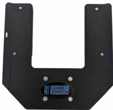
7160-1816 Honeywell RP4 Printer Mount