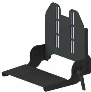
7160-0799 Tablet Keyboard Mount 7160-0799-01 Tablet Keyboard Mount - Tall Backplate

Configure your keyboard for ultimate ease of use and the fastest possible access with our large selection of Keyboard Mounts. With an ergonomic angle that meets user needs, working on the keyboard in the field can be more streamlined and reliable than ever before.