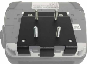
7160-1053 Zebra ZQ500 Printer Mount