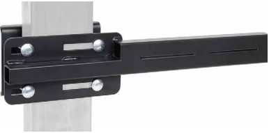
7160-0363 Horizontal Extension Bar

Increase your usable mounting space with our horizontal extension giving you more room to mount a total solution. Compatible with all Gamber-Johnson’s roll formed and tube clamp brackets to ensure secure fitment to any overhead guard leg profile.