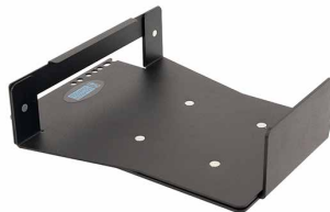
7160-1693 ZEBRA ZD620D, ZD620T, ZD621D, and ZD621T, 75MM HP Printer Mount