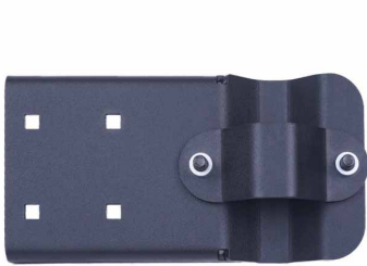
7160-0561 2", 2.5", 3" Diameter Tube Clamp

Expand your mounting location options by connecting your solution to multiple sizes of cylindrical poles, handles, or tubular style overhead guard legs. Adapt a Clam Shell product to finalize the total solution.