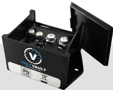
VOLTVAULT SHUT DOWN TIMER 7300-0409