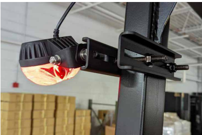
7160-1719 Forklift Light Mount