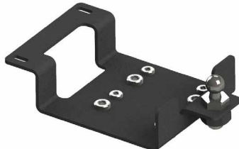
7160-1473 Zebra ZQ620 Printer Bracket