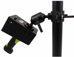
ZIRKONA 2" TO 3" POLE MOUNT WITH SCANNER POCKET