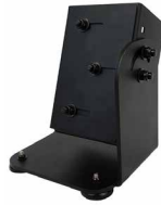
FLAT SURFACE MAGNET MOUNT WITH SCANNER HOLDER