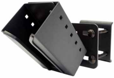
SCANNER POCKET MOUNT WITH SMALL BACK PLATE

Safeguard handheld scanners from accidental drops and catastrophic damage by housing your device with the right mount to fit your operation's needs.