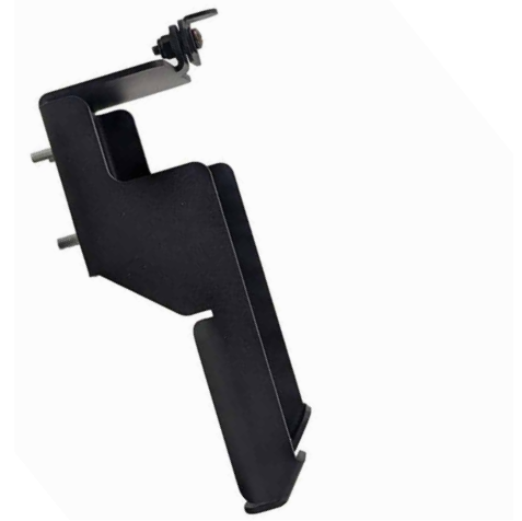
KEYENCE BT-A700 CRADLE