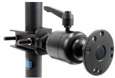
ZIRKONA 3/4" TO 1-7/8" POLE MOUNT WITH AMPS/ NEC MOUNTING PLATE