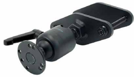
ZIRKONA 4" DIAMOND PLATE WITH LARGE JOINER AND AMPS/NEC PLATE