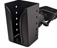
ZIRKONA 4" DIAMOND MOUNT