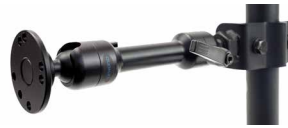
ZIRKONA 3/4" TO 1-7/8" POLE MOUNT WITH 6" MEDIUM JOINER AND AMPS PLATE