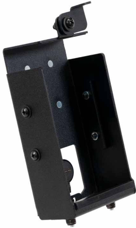
KEYENCE DX-A400 CRADLE