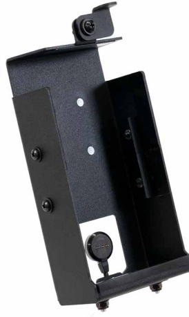
KEYENCE DX-A600 CRADLE