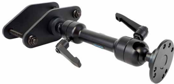
ZIRKONA 4" DIAMOND MOUNT WITH 6" MEDIUM JOINER AND AMPS PLATE

All available for purchase through KEYENCE.