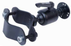
ZIRKONA 2" TO 3" POLE MOUNT WITH AMPS/NEC MOUNTING PLATE