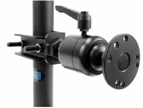
ZIRKONA 3/4" TO 1-7/8" POLE MOUNT WITH AMPS/NEC MOUNTING PLATE