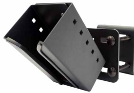
SCANNER POCKET MOUNT WITH SMALL BACK PLATE