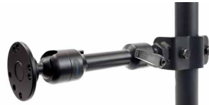
ZIRKONA 3/4" TO 1-7/8" POLE MOUNT WITH 6" MEDIUM JOINER AND AMPS PLATE