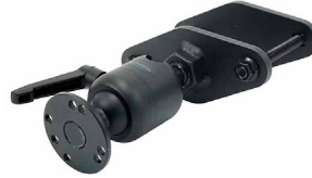
ZIRKONA 4" DIAMOND PLATE WITH LARGE JOINER AND AMPS/NEC PLATE