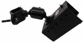
ZIRKONA 2" TO 3" POLE MOUNT WITH SCANNER POCKET

Check out more mounting options available from Gamber-Johnson.