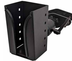
SCANNER POCKET MOUNT WITH ZIRKONA 4" DIAMOND MOUNT