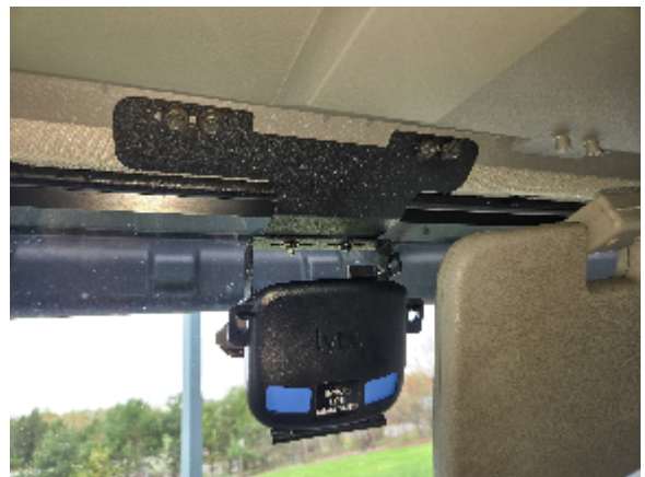
headliner mount with Lytx camera attached