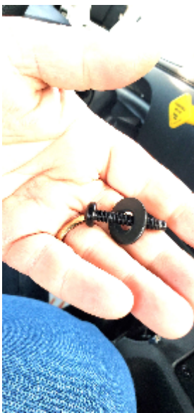
headliner bolt and washer