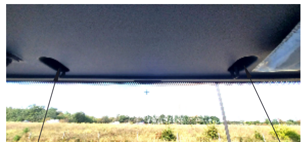
Remove these 2 screws in headliner