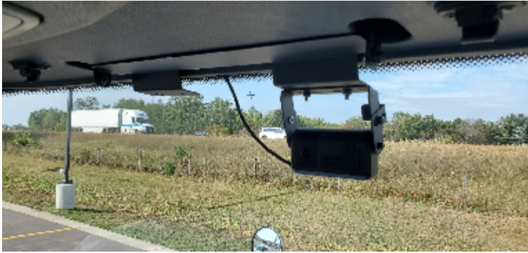
Samsara CM32 camera installed