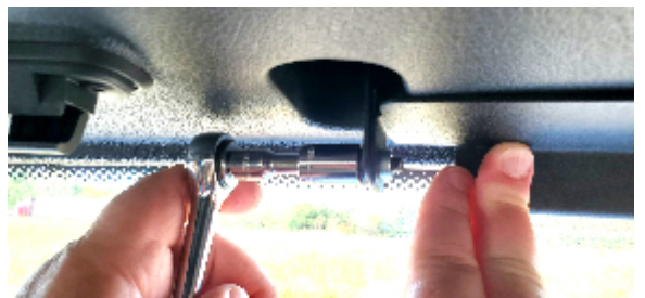
push up on the main bracket and tighten the hanger brackets in place