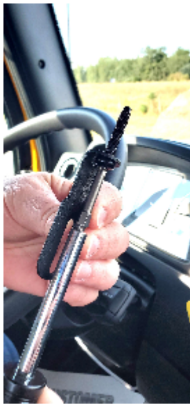
headliner bolt inserted through the hanger bracket without washer