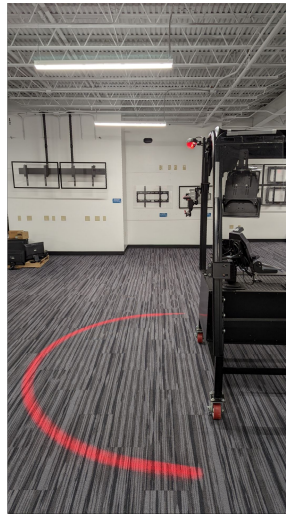
"Z" bracket mounted sideways