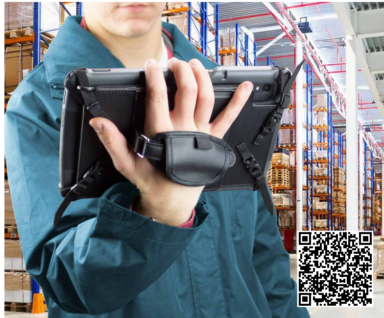
Moduflex Handstrap (p/n: FM-MFXPRO-ET4X10)

Mobile workers need to be efficient in order to get product shipped or production moving. Infocase allows the mobile worker to take their device with them, offering drop-protection and user-comfort.