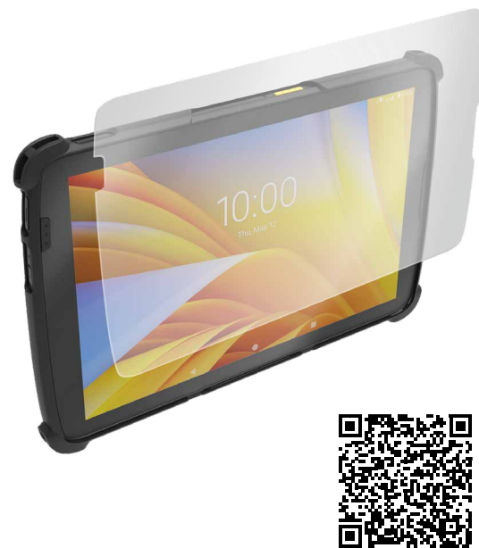
Tempered Glass Screen Protector (p/n: INF-SG-ZEB-ET4X8)