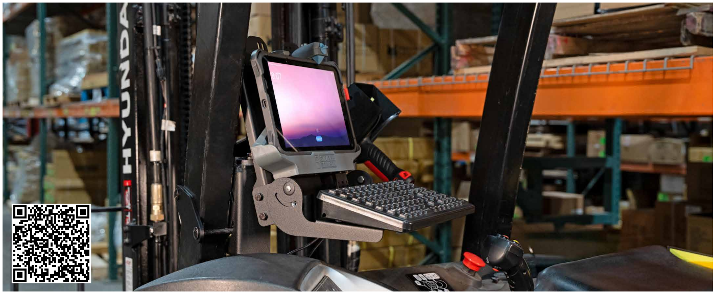
Single Arm Guard Leg Mount (p/n: 7160-1995) Honeywell ScanPal EDA10A Docking Station (p/n: 7160-2017-04) Tablet Keyboard Mount (p/n 7160-0799) Scanner Pocket Mount (p/n: 7160-1389) iKey Keyboard (p/n: 7300-0722)