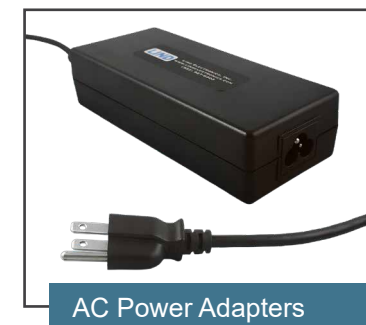
AC Power Adapters