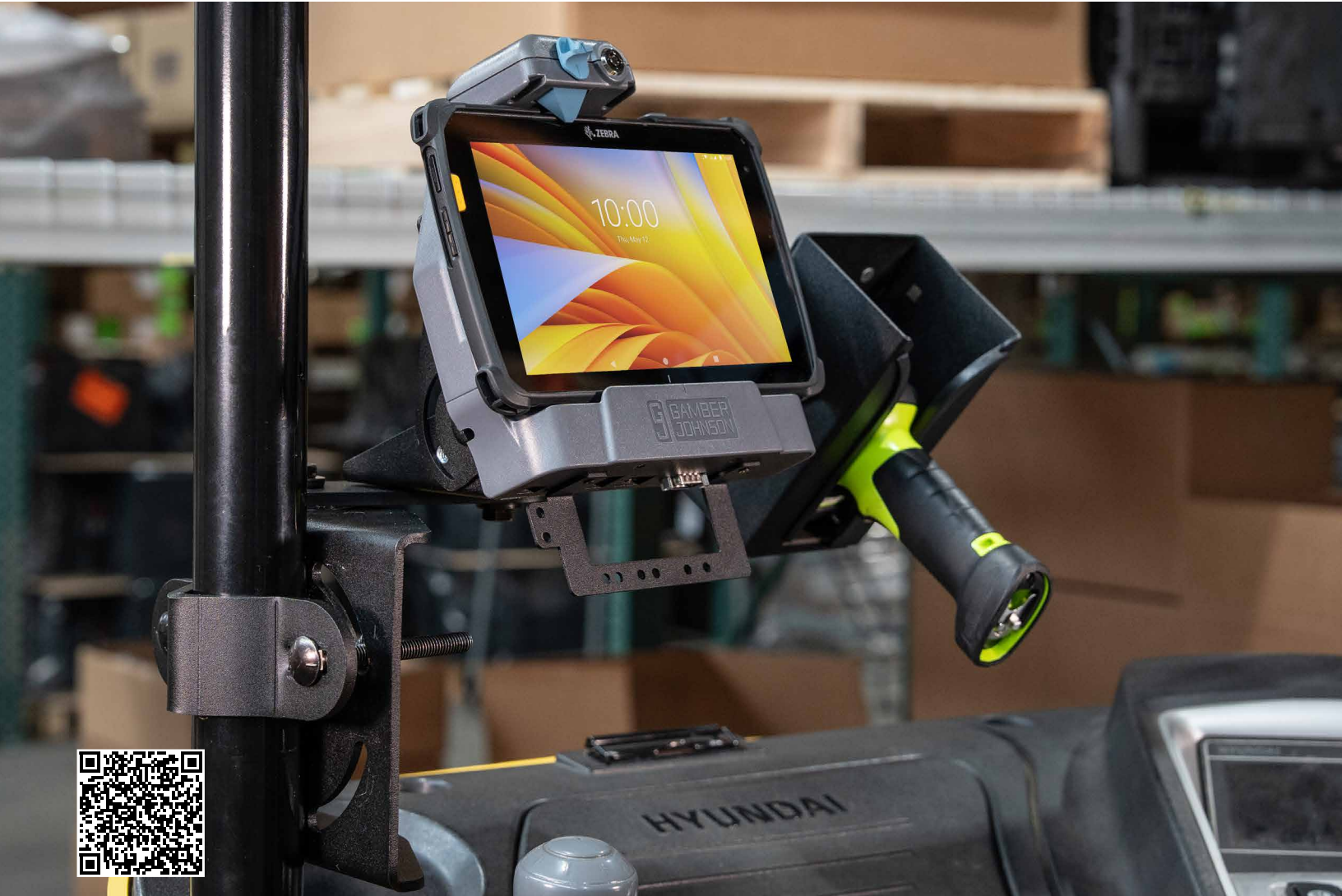
2-3" Round Post Guard Leg Mount (p/n: 7160-2103), Zebra ET4x Docking Station (p/n: 7160-1801-20), Scanner Pocket Mount (p/n: 7160-1389)

Loose devices such as handheld scanners, mobile printers, and tablets can be an expensive mistake if dropped. Know where your device is everytime it's needed with a reliable mount, whether on or off the forklift.