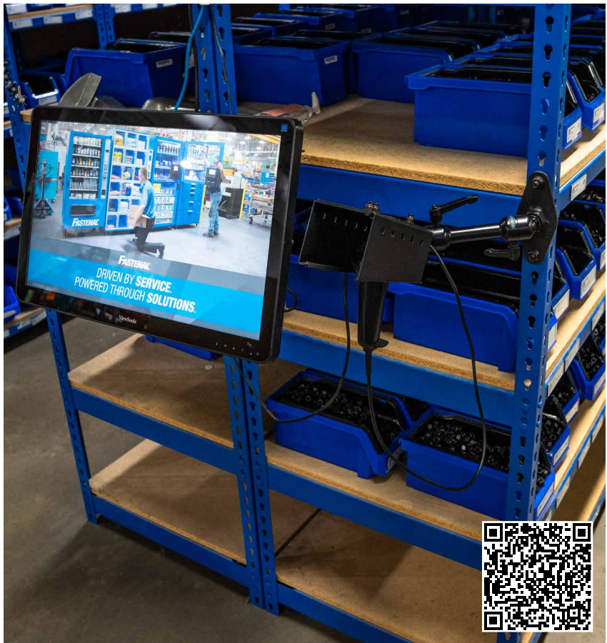
Zirkona 6" Joiner Mount (p/n: 7160-1466), Scanner Pocket (p/n: 7160-1433), Touchscreen Monitor Mount (p/n: 7160-1466-01)