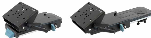
SHOWN: MONGOOSE® XLE 9"

XE stands for "eXtreme Edition". The pivot point is over center of the carriage. This version only allows the device to slide along the length of the arm.