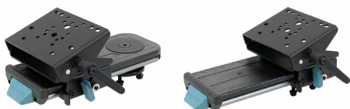
SHOWN: MONGOOSE® XE 9"

The Mongoose® XE and XLE product lines have one major difference between each other: