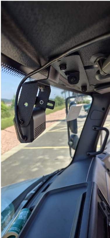
Samsara CM32 camera installed