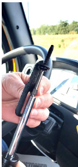
headliner bolt inserted through the hanger bracket without washer