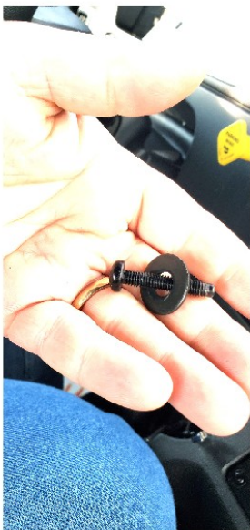
headliner bolt and washer