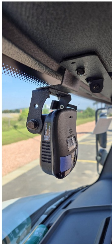
Lytx ER-SF300 camera installed