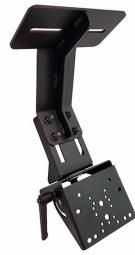
7160-1425 Overhead Guard Cab Mount