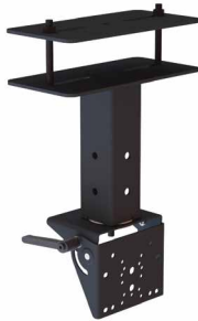
7160-0368 Overhead Guard Mount with Single Clam Shell