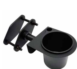
7160-1669 Fixed Forklift Cup Holder Mount