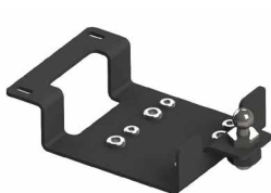
7160-1473 Zebra ZQ620 Printer Bracket