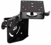
7160-2103 2-3" Round Tube Mount with Single Arm

Expand your mounting location options by connecting your solution to multiple sizes of cylindrical poles, handles, or tubular style overhead guard legs. Adapt a Clam Shell product to finalize the total solution.