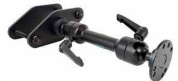
zirkona 7160-1466 Zirkona, 4" Diamond Plate with 6" Medium Dog-Bone and AMPs Plate 7160-1466-01 Zirkona, 4" Diamond Plate with 6" Medium Dog-Bone and VESA 75 mm Plate