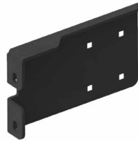
7160-1103 Linde E30 Latch Mounting Bracket