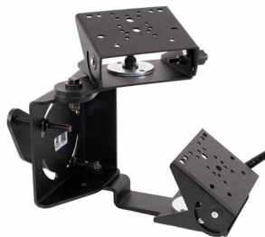
7160-2020 Guard Leg Mount with Dual Arms