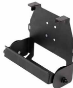
7160-2123 Zebra ZQ630 Printer Cradle