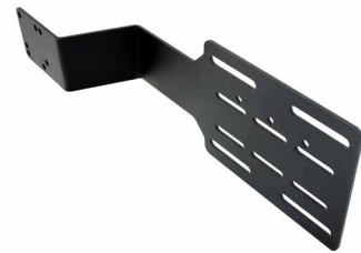
7160-0859 Number Pad Bracket