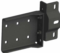
7160-1151 Toyota Cab Latch Mount for Electronic Hydraulics

Secure your valuable tablets and devices right in the cab of your material handling vehicle using one of our reliable OEM specific mounts. Perfectly suited to tailor your workspace to the most efficient, ergonomic, and secure configuration, all while protecting your valuable assets and lift vehicle operators.