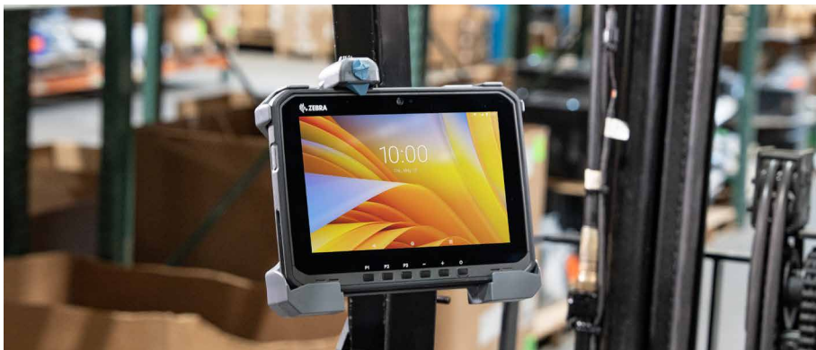
7160-0421 Dual Clam Shell with Arm and Large Backer Plate