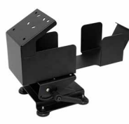
7170-1248 Large Fanfold Mount: Magnetic