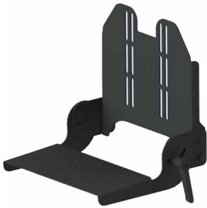
7160-0799 Tablet Keyboard Mount 7160-0799-01 Tablet Keyboard Mount - Tall Backplate

Configure your keyboard for ultimate ease of use and the fastest possible access with our large selection of Keyboard Mounts. With an ergonomic angle that meets user needs, working on the keyboard in the field can be more streamlined and reliable than ever before.