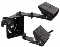
7160-2122 2-3" Round Tube Mount with Double Arms