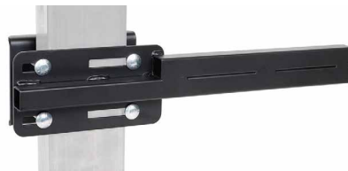
7160-0363 Horizontal Extension Bar

Increase your usable mounting space with our horizontal extension giving you more room to mount a total solution. Compatible with all Gamber-Johnson's roll formed and tube clamp brackets to ensure secure fitment to any overhead guard leg profile.