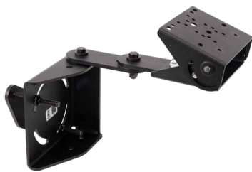
7160-1995 Guard Leg Mount