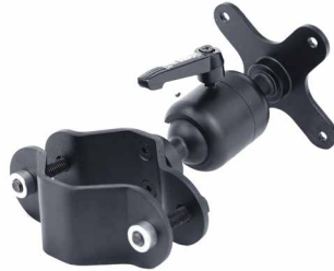
zirkona 7160-1356-01 Zirkona 2" to 3" Pole Mount with VESA 75mm Mounting Plate 7160-1356 Zirkona 2" to 3" Pole Mount with AMPS/NEC Mounting Plate