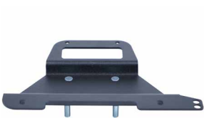
7160-0817 Zebra ZQ630/QLN420 Printer Bracket

Continue to expand from a desk to a mobile work environment by creating a secure and accessible way to mount rugged mobile printers.