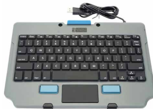
7160-1449-00 Rugged Lite Keyboard