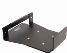
7160-1693 ZEBRA ZD620D, ZD620T, ZD621D, and ZD621T, 75MM HP Printer Mount