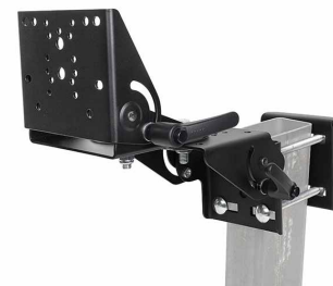
7160-0420 Dual Clam Shell with Arm and Small Backer Plate