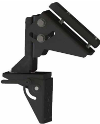
7160-1591 Tall Adjustable Overhead Guard Bar-short