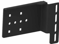
7160-1233 Toyota Cab Mount