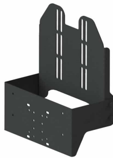
7160-1257 Vertical Tablet Keyboard Mount 7160-1257-01 Vertical Tablet Keyboard Mount - Tall Backplate