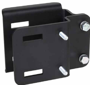
7160-0418 For Yale/Hyster, Crown, and others 7160-1542 For CLARK 7160-0814 For Jungheinrich / CAT / Toyota 7160-0815 For Linde Models EV-30 and EV40

Pair with with DUAL CLAM SHELL MOUNT (PG.6) to complete your solution