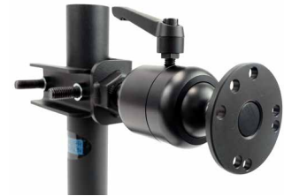
zirkona 7160-1367-01 Zirkona 3/4" to 1 7/8" Pole Mount with VESA 75mm Mounting Plate 7160-1367 Zirkona 3/4" to 1-7/8" Pole Mount with AMPS/NEC Mounting Plate