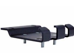
7160-1053 Zebra ZQ500 Printer Mount