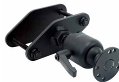
zirkona 7160-1261 Zirkona 4" Diamond Plate with Large Joiner and AMPS/NEC Plate 7160-1261-01 Zirkona 4" Diamond Plate with Large Joiner and VESA 75mm Plate

When it comes to mounting lightweight devices turn to Gamber-Johnson's diamond plate mounts for a reliable solution. Multiple product offerings to interface your device with various hole patterns and ample adjustability to accommodate operator comfort and ease of use.