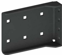
7160-1096 Clamp Bracket Adapter