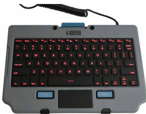
7170-0817-01 Rugged Lite Backlit Keyboard and Quick Release Keyboard Cradle