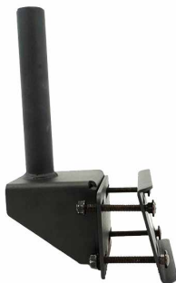
7160-1810 Shrink Wrap Mount - Small Back Plate