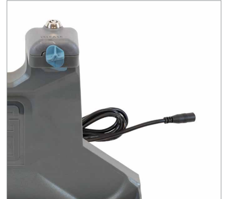
2.5MM JACK 7160-2017-04